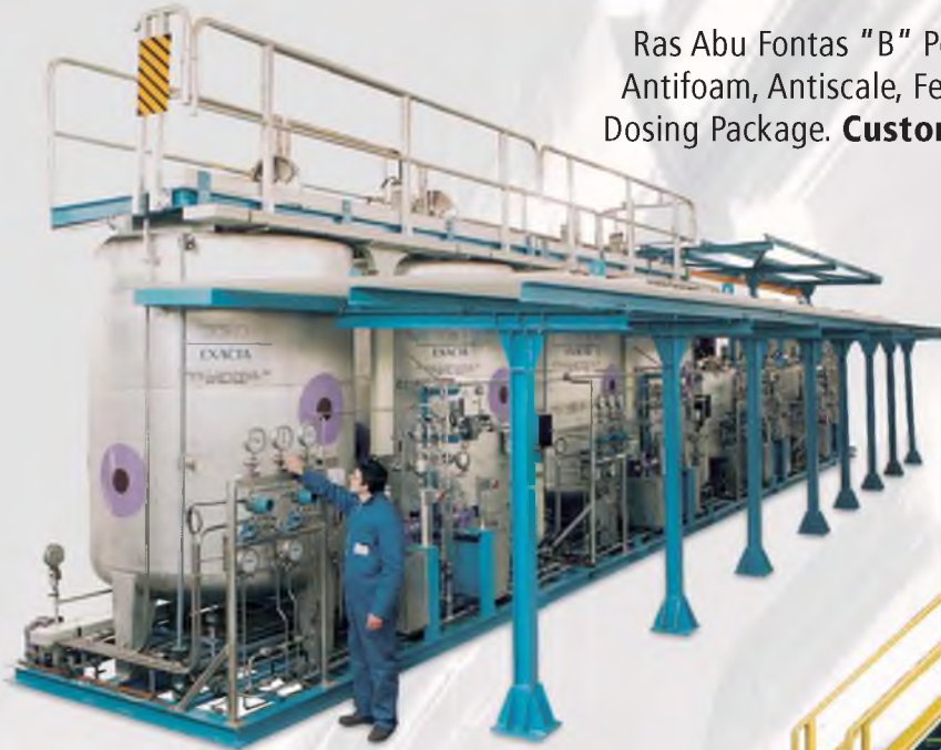
Ras Abu Fontas "B" Power and Desalination Plant - Qatar Antifoam, Antiscale, Ferrous Sulphate and Sodium Sulphite Dosing Package. Customer: Weir Westgarth - Scotland