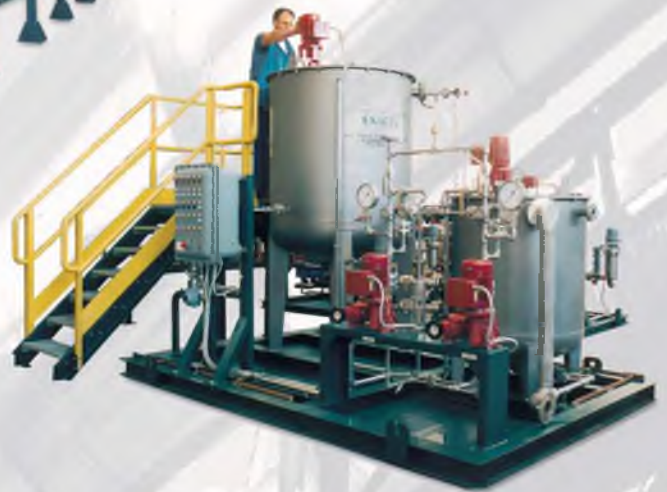
Lomellina Energia Power Plant - Italy Phosphate Injection Package. Customer: Foster Wheeler - Italy