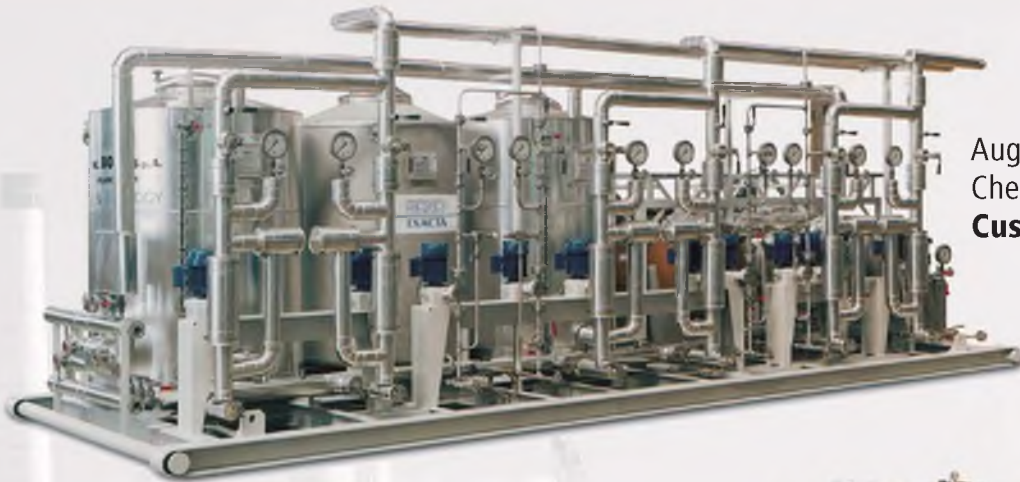
Augusta Chemical Plant - Italy. Chemical Dosing Package. Customer: K.T.I. - Italy