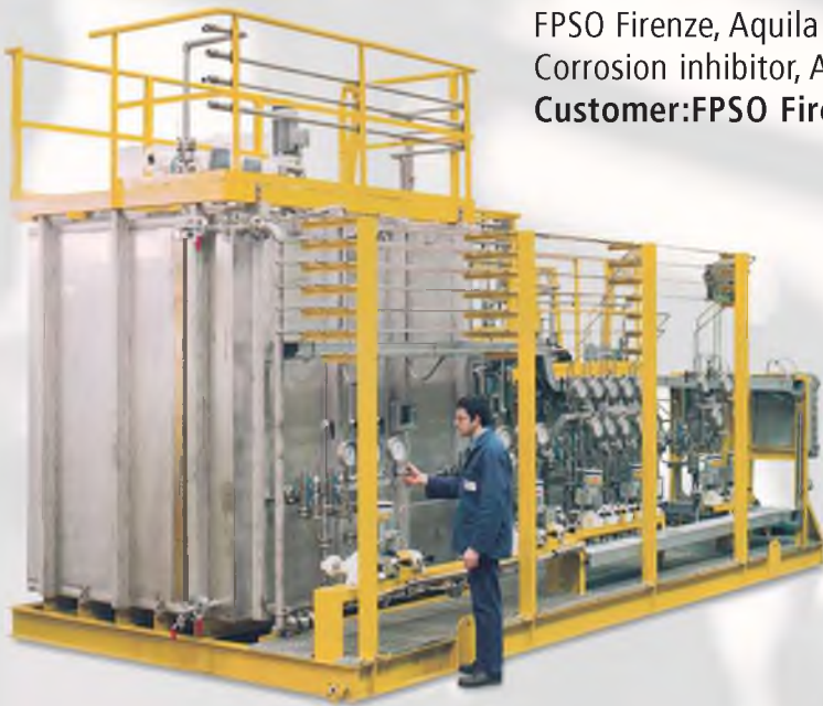
FPSO Firenze, Aquila Field - Italy Corrosion inhibitor, Antifoam and Antiscale Injection Package. Customer: FPSO Firenze - Portugal