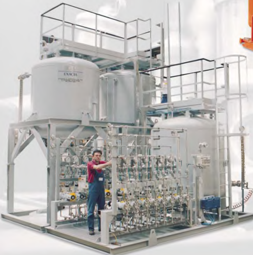
Zirku Gas Project - United Arab Emirates Glycol and Corrosion Inhibitor Injection Package. Customer: Technip Geoproduction - France