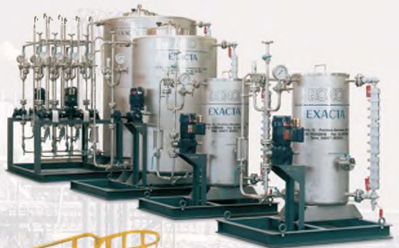
Dubai MTBE Complex - United Arab Emirates. Phosphate, Oxygen Scavenger, Amine and Corrosion Inhibitor Dosing Packages. Customer: Colt Engineering - Canada