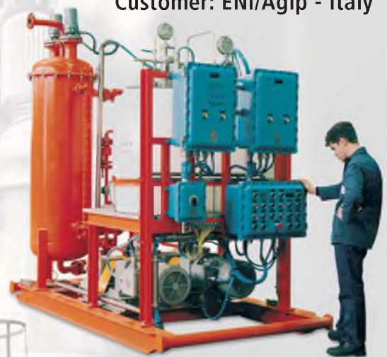
PC-80 Off-Shore Platform - Italy Chemical Dosing and Water Reinjection Package. Customer: ENI/Agip - Italy