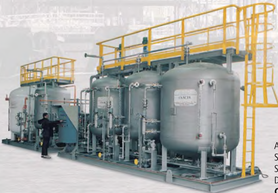
Amerya Ethylene Plant - Egypt. Sulphuric Acid, Biodispersant, Scale Inhibitor and Biocide Dosing Package. Customer. ENPPI - Egypt