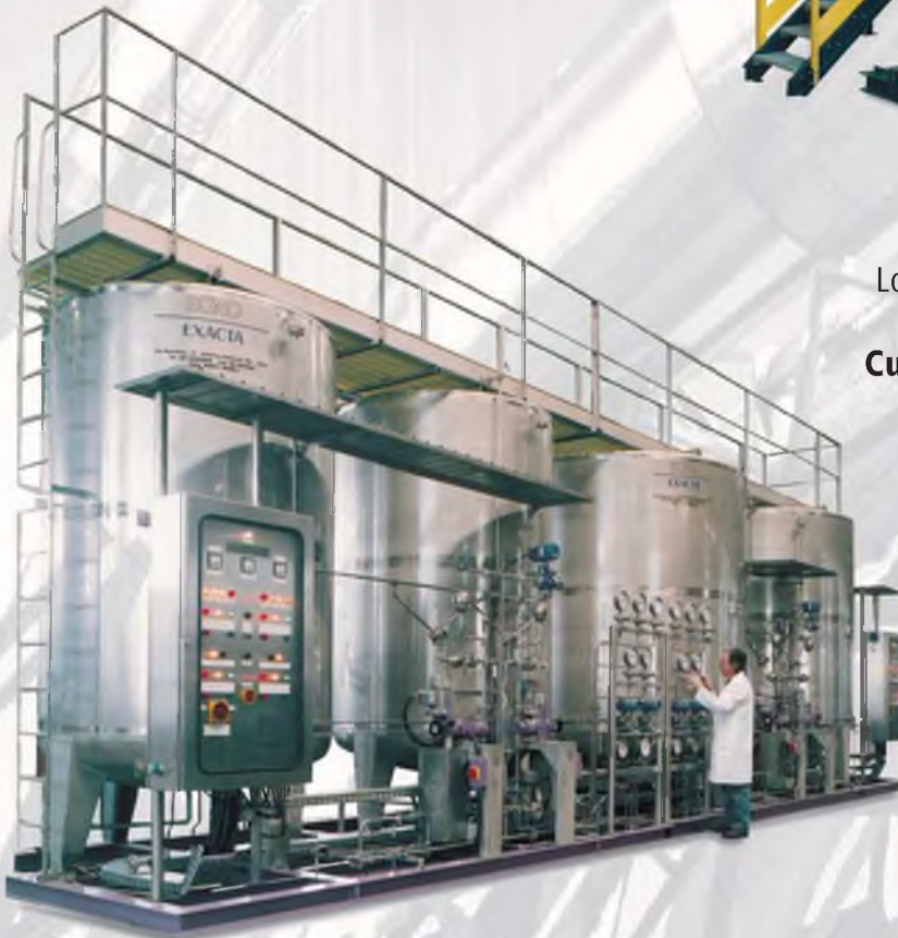
Jebel Ali "G" Power and Desalination Plant - United Arab Emirates Antifoam and Antiscale Dosing Package. Customer: Weir Westgarth - Scotland